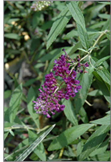
Buzz Midnight Butterfly Bush flowers