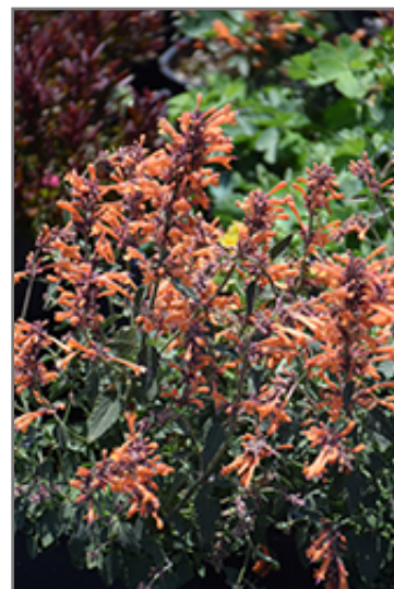
Kudos Mandarin Hyssop flowers

This is a relatively low maintenance plant, and is best cleaned up in early spring before it resumes active growth for the season. It is a good choice for attracting bees, butterflies and hummingbirds to your yard, but is not particularly attractive to deer who tend to leave it alone in favor of tastier treats. It has no significant negative characteristics.