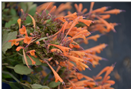
Kudos Mandarin Hyssop flowers