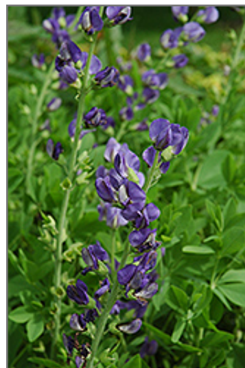
Blue Wild Indigo flowers