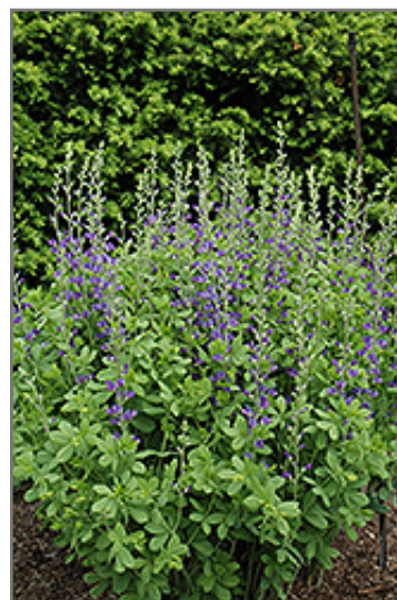
Blue Wild Indigo in bloom