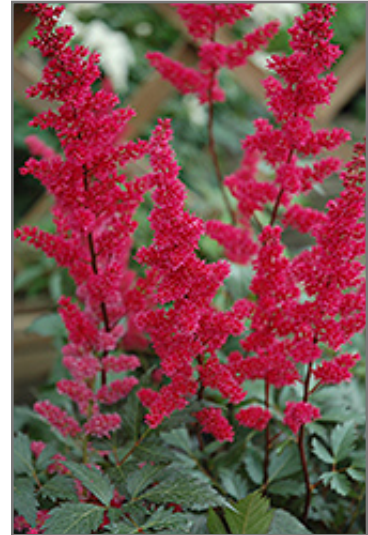
Fanal Astilbe flowers