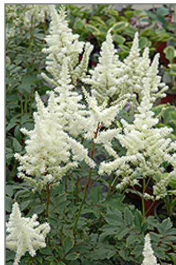
Bridal Veil Astilbe flowers

Bridal Veil Astilbe is recommended for the following landscape applications;