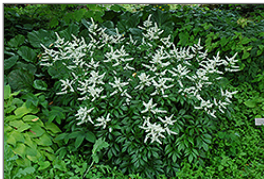
Bridal Veil Astilbe in bloom