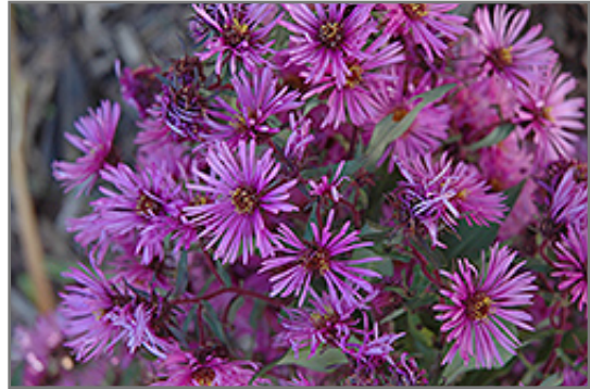
Woods Pink Aster flowers

Woods Pink Aster will grow to be about 16 inches tall at maturity, with a spread of 24 inches. Its foliage tends to remain dense right to the ground, not requiring facer plants in front. It grows at a medium rate, and under ideal conditions can be expected to live for approximately 10 years.