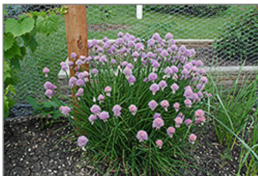
Chives in bloom