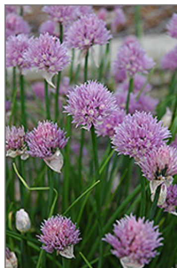
Chives flowers