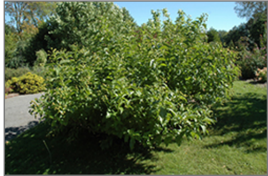
Sputnik Button Bush