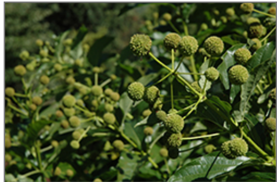
Sputnik Button Bush fruit