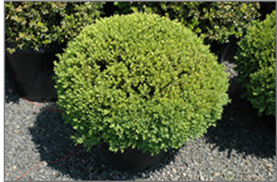
Green Velvet Boxwood (globe form)

Green Velvet Boxwood (globe form) will grow to be about 3 feet tall at maturity, with a spread of 3 feet. It tends to fill out right to the ground and therefore doesn't necessarily require facer plants in front. It grows at a slow rate, and under ideal conditions can be expected to live for approximately 30 years.