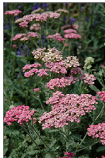
Song Siren Angie Yarrow flowers