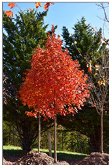
Flashfire Sugar Maple in fall