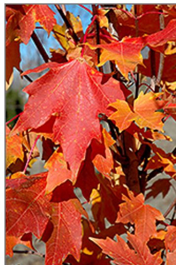
Flashfire Sugar Maple in fall