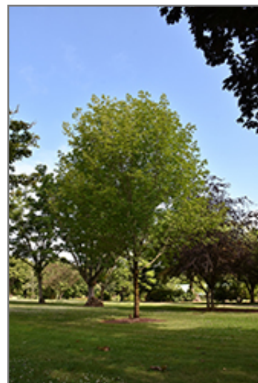
Flashfire Sugar Maple

This tree should only be grown in full sunlight. It prefers to grow in average to moist conditions, and shouldn't be allowed to dry out. It is not particular as to soil pH, but grows best in rich soils. It is somewhat tolerant of urban pollution. This is a selection of a native North American species.