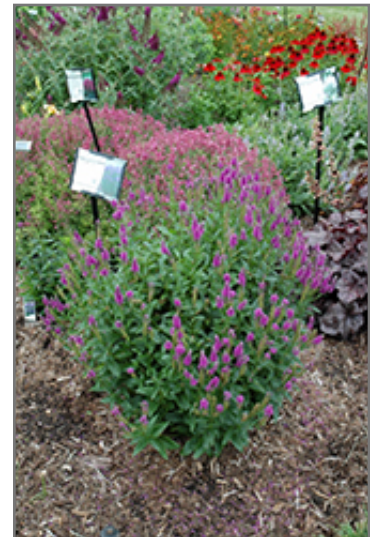
Very Van Gogh Speedwell in bloom