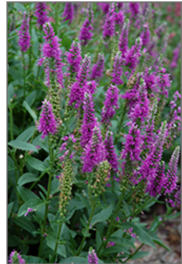
Very Van Gogh Speedwell flowers

Very Van Gogh Speedwell is recommended for the following landscape applications;