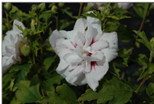
China Chiffon Rose of Sharon flowers

China Chiffon Rose of Sharon is recommended for the following landscape applications;