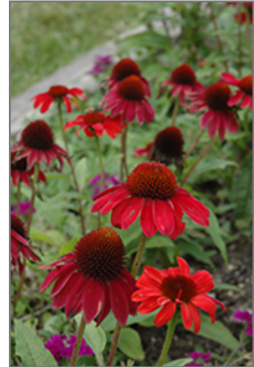
Sombrero Baja Burgundy Coneflower flowers