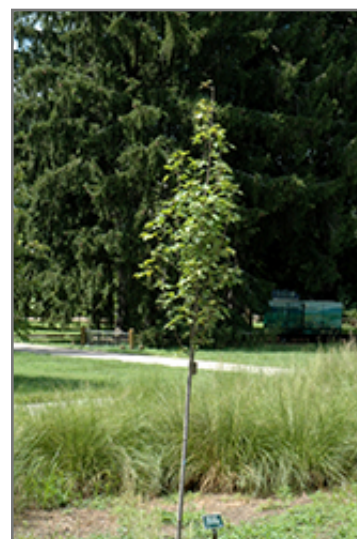
Armstrong Gold Red Maple