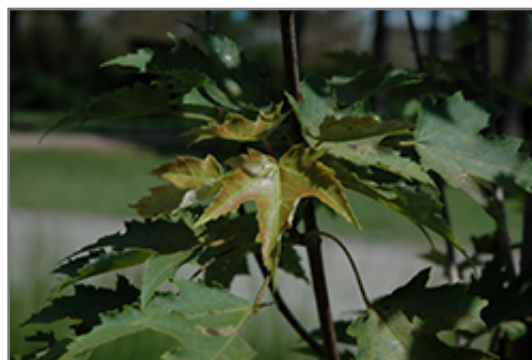
Armstrong Gold Red Maple foliage