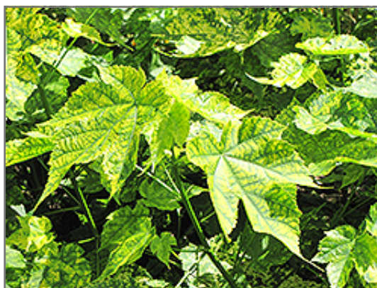
Mardi Gras Flowering Maple foliage