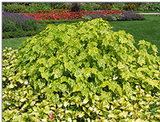
Mardi Gras Flowering Maple