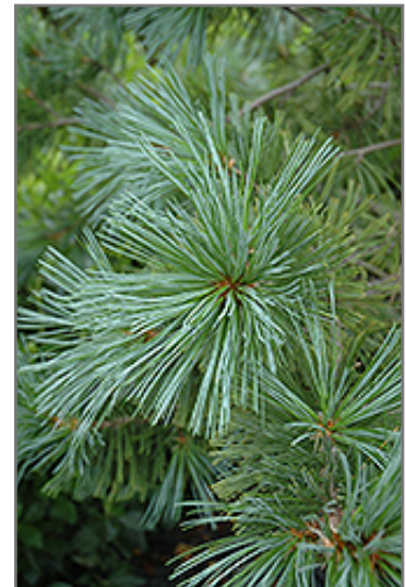
Vanderwolf's Pyramid Pine foliage