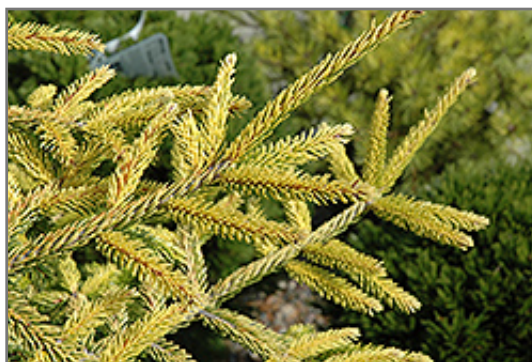
Skylands Golden Spruce foliage