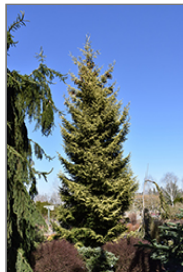
Skylands Golden Spruce