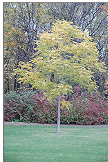
Kentucky Coffeetree in fall