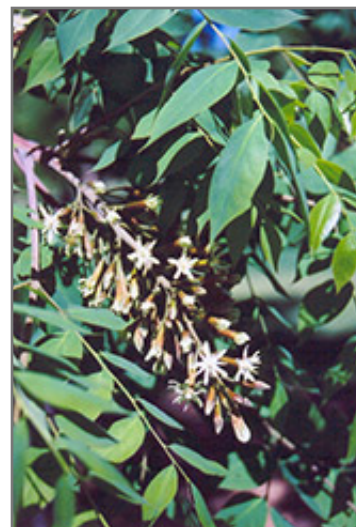
Kentucky Coffeetree flowers

This tree should only be grown in full sunlight. It is very adaptable to both dry and moist locations, and should do just fine under average home landscape conditions. It is considered to be drought-tolerant, and thus makes an ideal choice for xeriscaping or the moisture-conserving landscape. It is not particular as to soil type or pH. It is somewhat tolerant of urban pollution. This species is native to parts of North America.