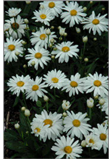
Whoops-A-Daisy Shasta Daisy flowers