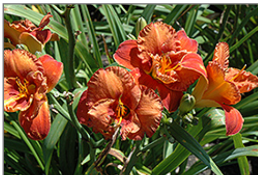
Mighty Chestnut Daylily flowers