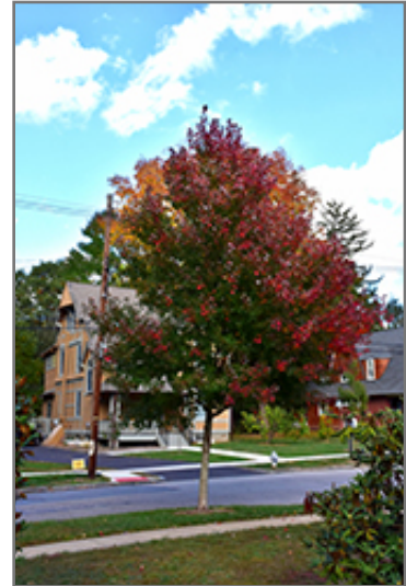
Redpointe Red Maple in fall

This tree should only be grown in full sunlight. It is quite adaptable, preferring to grow in average to wet conditions, and will even tolerate some standing water. It is not particular as to soil type, but has a definite preference for acidic soils, and is subject to chlorosis (yellowing) of the leaves in alkaline soils. It is somewhat tolerant of urban pollution. This is a selection of a native North American species.