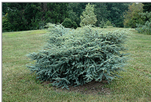
Horstmann Blue Atlas Cedar

This shrub should only be grown in full sunlight. It is very adaptable to both dry and moist growing conditions, but will not tolerate any standing water. It is not particular as to soil type or pH. It is somewhat tolerant of urban pollution, and will benefit from being planted in a relatively sheltered location. Consider applying a thick mulch around the root zone in winter to protect it in exposed locations or colder microclimates. This is a selected variety of a species not originally from North America.