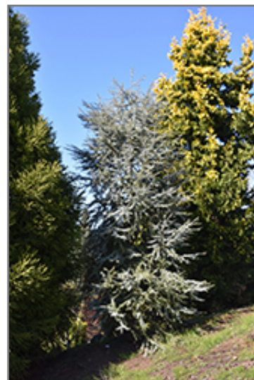
Horstmann Blue Atlas Cedar