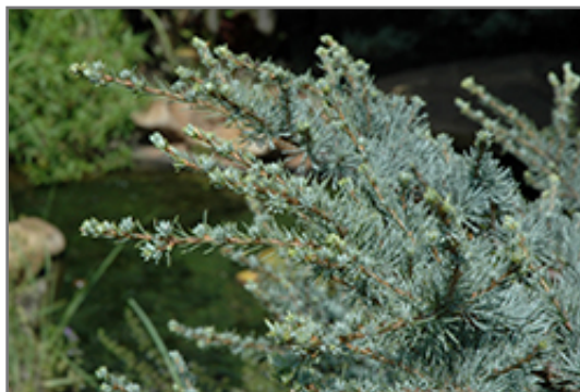
Horstmann Blue Atlas Cedar foliage