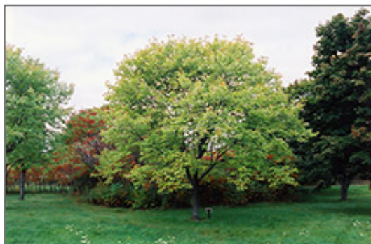
Schlesinger Red Maple