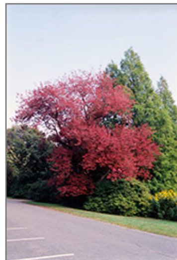
Schlesinger Red Maple in fall