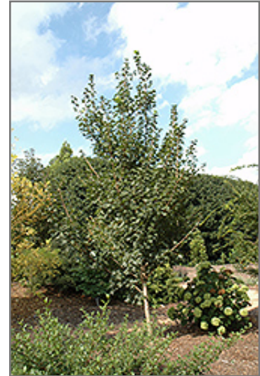
Rugged Ridge Miyabe Maple

Rugged Ridge Miyabe Maple will grow to be about 55 feet tall at maturity, with a spread of 40 feet. It has a high canopy with a typical clearance of 6 feet from the ground, and should not be planted underneath power lines. As it matures, the lower branches of this tree can be strategically removed to create a high enough canopy to support unobstructed human traffic underneath. It grows at a fast rate, and under ideal conditions can be expected to live for 80 years or more.