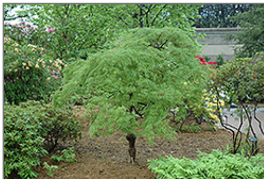
Cutleaf Japanese Maple