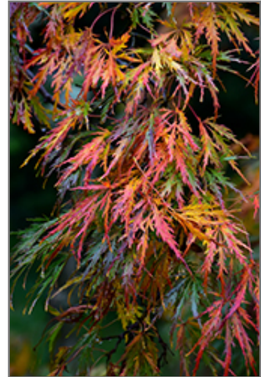
Cutleaf Japanese Maple in fall

Cutleaf Japanese Maple makes a fine choice for the outdoor landscape, but it is also well-suited for use in outdoor pots and containers. Because of its height, it is often used as a 'thriller' in the 'spiller-thriller-filler' container combination; plant it near the center of the pot, surrounded by smaller plants and those that spill over the edges. Note that when grown in a container, it may not perform exactly as indicated on the tag - this is to be expected. Also note that when growing plants in outdoor containers and baskets, they may require more frequent waterings than they would in the yard or garden.