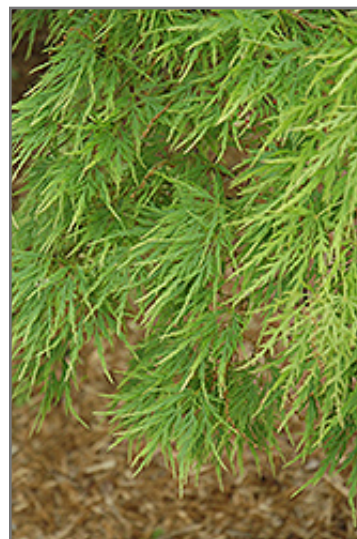
Cutleaf Japanese Maple foliage

Cutleaf Japanese Maple is recommended for the following landscape applications;