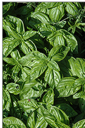
Genovese Compact Basil foliage

This plant can be integrated into a landscape or flower garden by creative gardeners, but is usually grown in a designated herb garden. It should only be grown in full sunlight. It prefers to grow in average to moist conditions, and shouldn't be allowed to dry out. It is not particular as to soil type or pH. It is somewhat tolerant of urban pollution. This is a selected variety of a species not originally from North America. It can be propagated by cuttings; however, as a cultivated variety, be aware that it may be subject to certain restrictions or prohibitions on propagation.