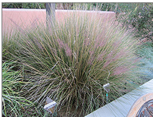
Pink Muhly Grass

Pink Muhly Grass is recommended for the following landscape applications;