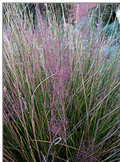
Pink Muhly Grass flowers