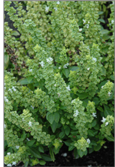
Spicy Globe Basil flowers

This plant is quite ornamental as well as edible, and is as much at home in a landscape or flower garden as it is in a designated edibles garden. It should only be grown in full sunlight. It prefers to grow in average to moist conditions, and shouldn't be allowed to dry out. It is not particular as to soil type or pH. It is somewhat tolerant of urban pollution. This is a selected variety of a species not originally from North America. It can be propagated by cuttings; however, as a cultivated variety, be aware that it may be subject to certain restrictions or prohibitions on propagation.