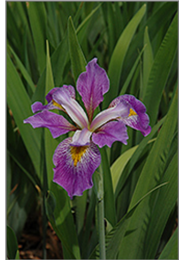
Southern Blue Flag Iris flowers