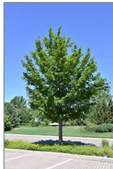
State Street Miyabe Maple

State Street Miyabe Maple will grow to be about 40 feet tall at maturity, with a spread of 30 feet. It has a high canopy with a typical clearance of 5 feet from the ground, and should not be planted underneath power lines. It grows at a fast rate, and under ideal conditions can be expected to live for 80 years or more.