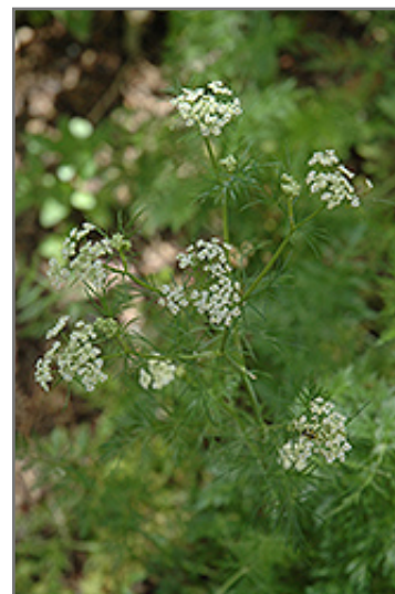
Caraway flowers