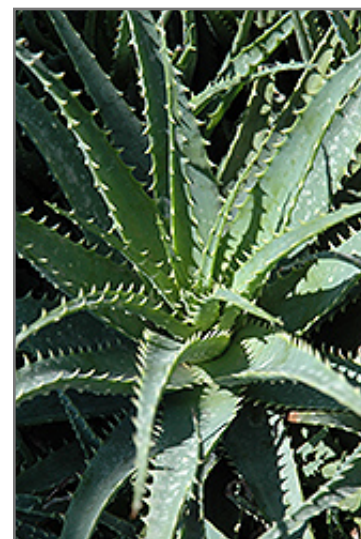
Hedgehog Aloe foliage