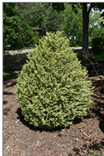
Variegated Boxwood