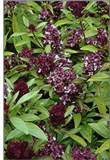
Siam Queen Basil flowers

Siam Queen Basil will grow to be about 16 inches tall at maturity, with a spread of 12 inches. When grown in masses or used as a bedding plant, individual plants should be spaced approximately 10 inches apart. This fast-growing annual will normally live for one full growing season, needing replacement the following year.