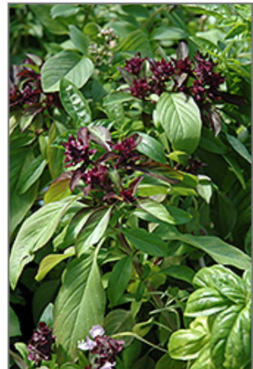
Siam Queen Basil foliage