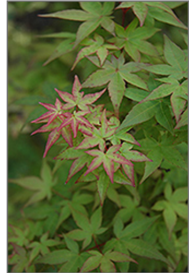
Chishio Japanese Maple foliage