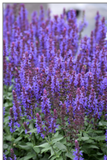
Sensation Sky Blue Meadow Sage flowers