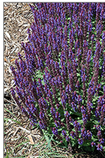
Sensation Sky Blue Meadow Sage flowers

Sensation Sky Blue Meadow Sage is recommended for the following landscape applications;