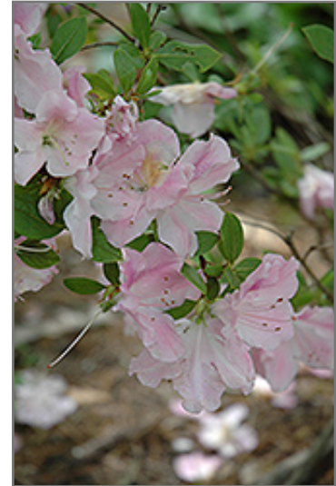
Encore Autumn Sweetheart Azalea flowers

Encore Autumn Sweetheart Azalea will grow to be about 4 feet tall at maturity, with a spread of 4 feet. It tends to be a little leggy, with a typical clearance of 1 foot from the ground. It grows at a slow rate, and under ideal conditions can be expected to live for 40 years or more.