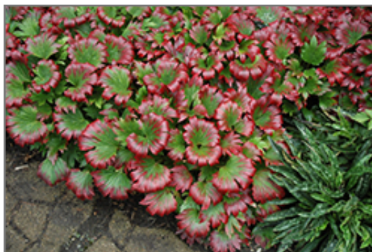
Karasuba Mukdenia