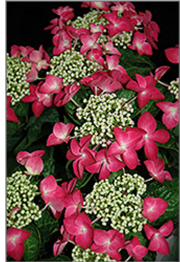
Strawberries And Cream Hydrangea flowers