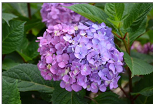
Bloomstruck Hydrangea flowers