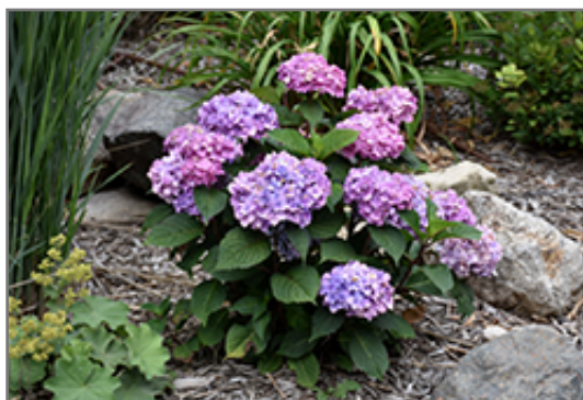
Bloomstruck Hydrangea in bloom