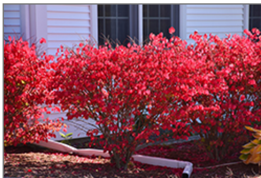
Chicago Fire Burning Bush in fall