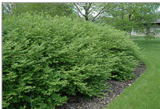
Chicago Fire Burning Bush