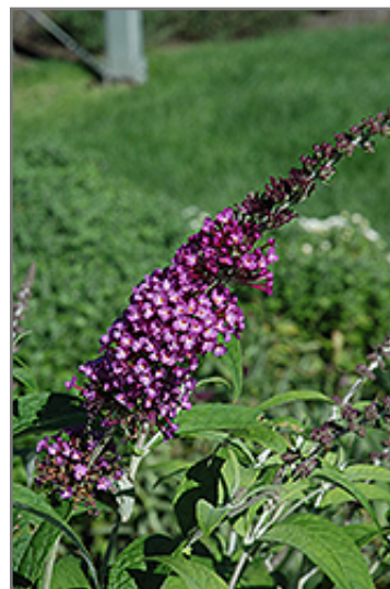
Buzz Pink Purple Butterfly Bush flowers