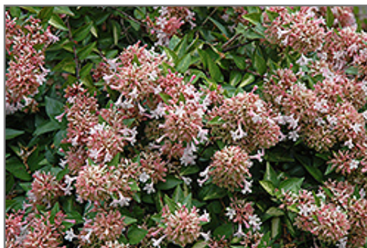
Canyon Creek Abelia flowers