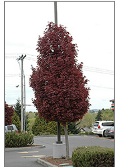
Crimson Sentry Norway Maple

Crimson Sentry Norway Maple will grow to be about 40 feet tall at maturity, with a spread of 25 feet. It has a low canopy with a typical clearance of 5 feet from the ground, and should not be planted underneath power lines. It grows at a medium rate, and under ideal conditions can be expected to live to a ripe old age of 100 years or more; think of this as a heritage tree for future generations!