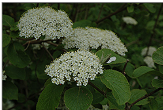
Aurora Viburnum flowers

Aurora Viburnum is recommended for the following landscape applications;