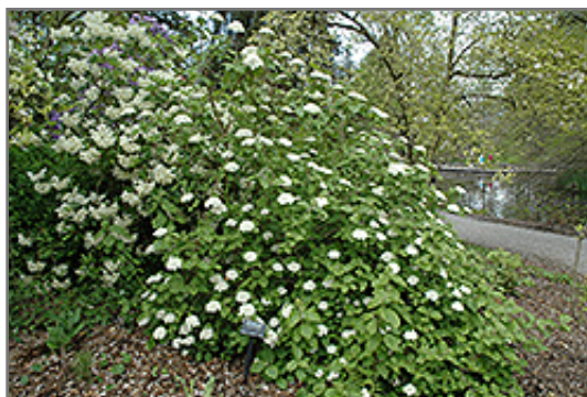
Aurora Viburnum in bloom