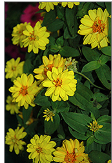
Profusion Double Yellow Zinnia flowers