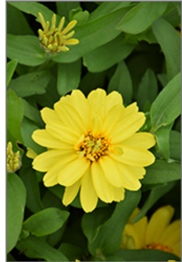
Profusion Double Yellow Zinnia flowers