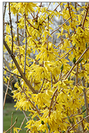
Northern Gold Forsythia flowers