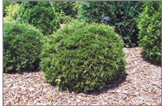
Hetz Midget Arborvitae

Hetz Midget Arborvitae will grow to be about 24 inches tall at maturity, with a spread of 3 feet. It tends to fill out right to the ground and therefore doesn't necessarily require facer plants in front. It grows at a slow rate, and under ideal conditions can be expected to live for approximately 30 years.