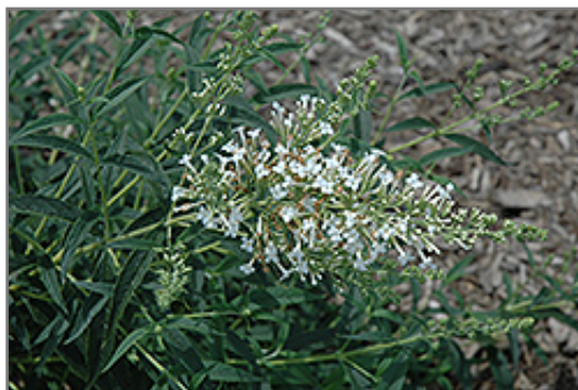
Flutterby Petite Snow White Butterfly Bush flowers